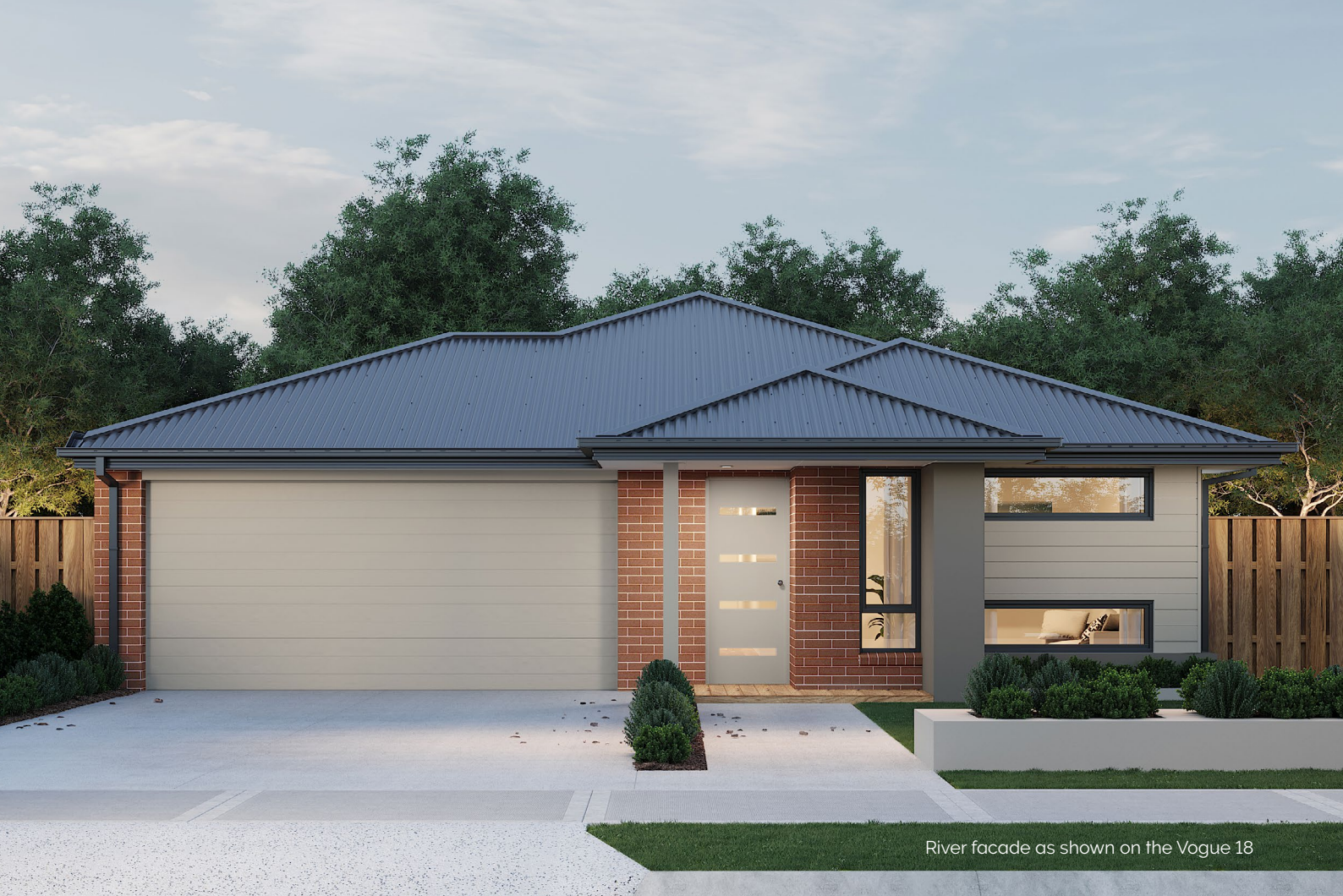
River facade as shown on the Vogue 18