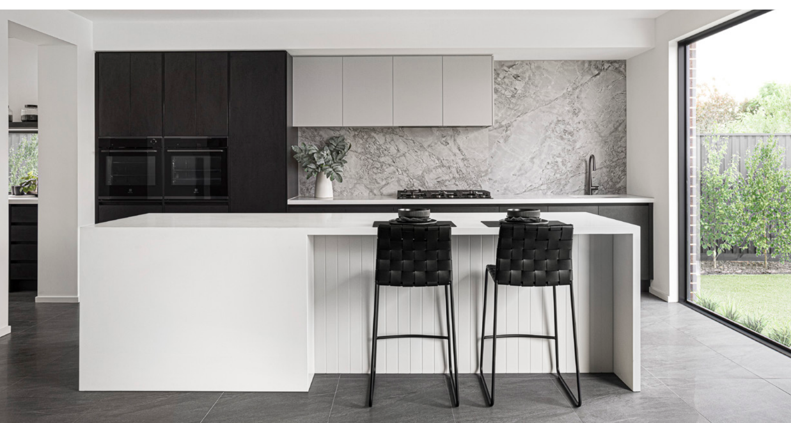
As displayed at 220 Soldiers Road, Berwick